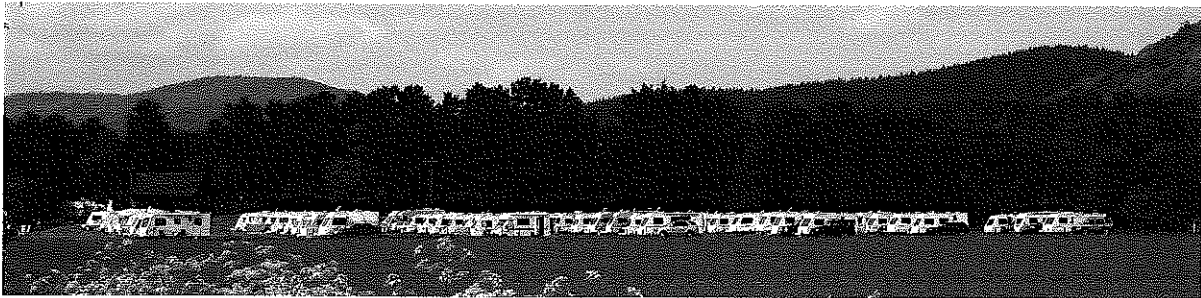
A Caravan Rally completely fills Monaltrie Park 2008

There is a wide range of demands on Monaltrie Park. Among the events held there are the Ballater Highland Games, the Vintage Vehicle Rally and Sunday Fayre of Ballater Victoria Week, a fun fair, a caravan rally and the village fireworks display. Football is played regularly and, in winter, the Ballater Boules club holds its meetings there. The park is even occasionally used as a helicopter landing site. In 2004 a well-attended Planning for Real © exercise carried out in Ballater showed up a very wide range of demands for this park. (An Excel spreadsheet detailing the responses to that exercise is to be found on the attached CD and can be downloaded from the webpage www.royal-deeside.org.uk/rdcommactive/planning.htm )