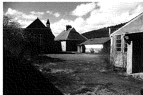
The grounds of the old school at Ballater : a possible site for low-cost housing

The problem of providing affordable homes should be addressed as a specific issue. It should not be used to provide justification for a large-scale housing development.